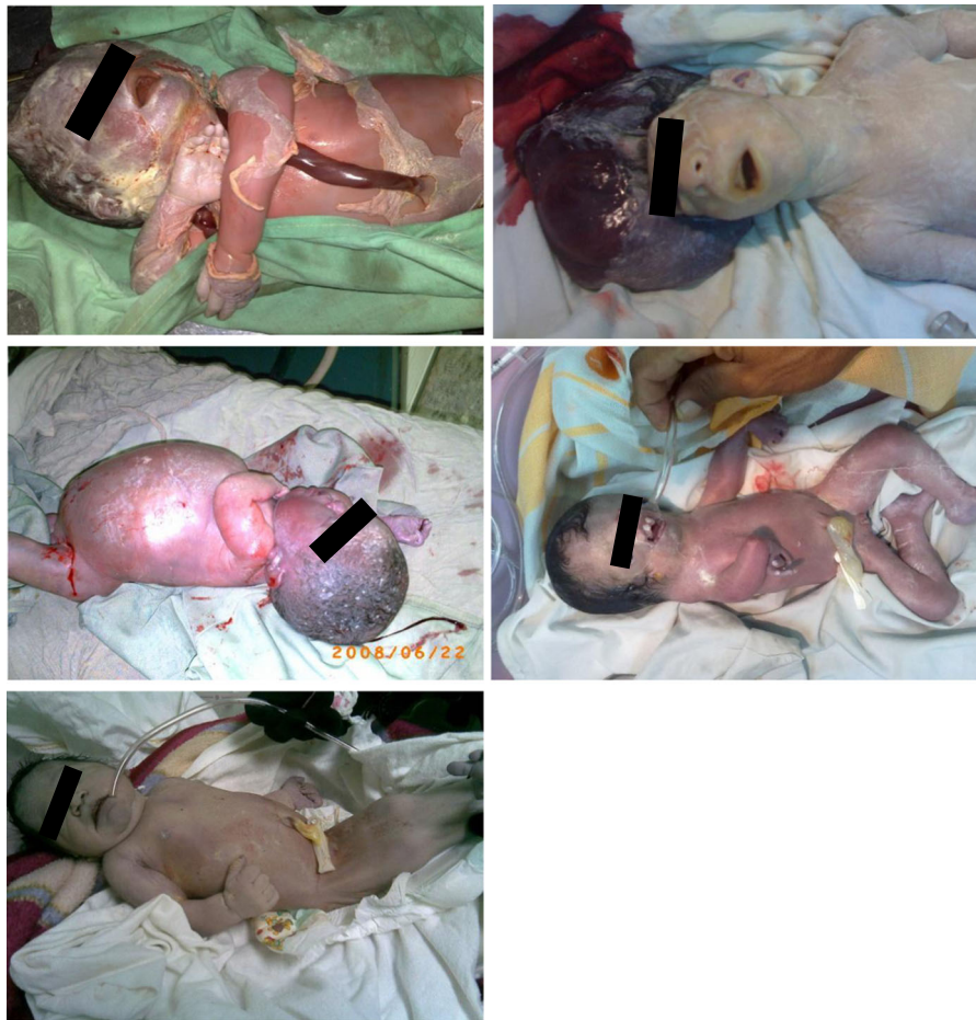
Fig. 3 Selected photos of children born in Fallujah between 2008 and 2010, showing severe neurodevelopmental disorders, in the form of multiple birth defects

the 1960s. It is favored because it weighs less than other metals and it does not rust. It is estimated that about 55 % of the Ti manufactured in North America is utilized in the military and aerospace industries. Titanium is used extensively in US weapons systems,